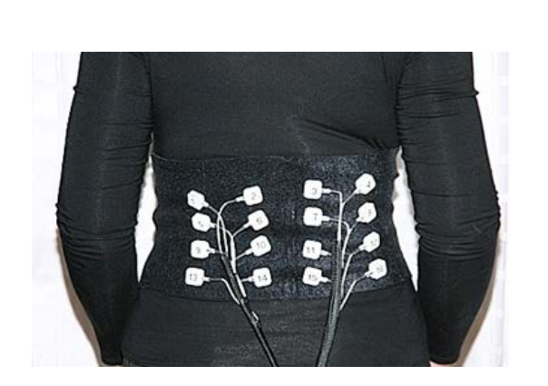
Figure 3- Tactaid Device (Health Products For You)