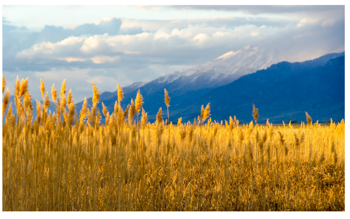
Phragmites australis is an invasive species in Great Salt Lake wetlands