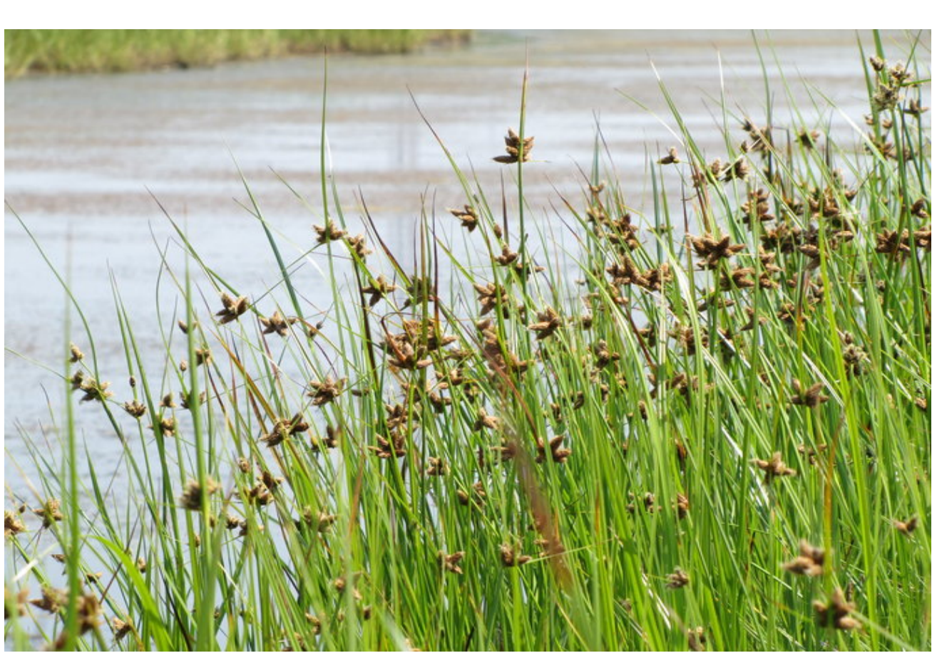
Alkali bulrush ( Bolboschoenus maritimus )

Surfactant seed coatings have aided the germination of upland plant species in restoration projects by increasing the water available for seeds in soil (Madsen et al., 2016). However, these coatings have not been tested on wetland species. In this project, we tested the effect of a surfactant seed coating and varying levels of moisture availability on alkali bulrush in two greenhouse experiments. If this surfactant seed coating is effective for alkali bulrush, it could aid efforts to revegetate wetland areas in the Great Salt Lake and beyond and restore critical wildlife habitat.