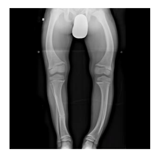
Figure 2: Bowed legs seen in x-ray of child with rickets (Ott, 2016).

As vitamin D facilitates dietary calcium absorption and promotes bone health, severe deficiency seen among children often results in rickets. Rickets is a condition that causes softening and weakening of the bones and is commonly diagnosed between the ages of 3 months and 3 years, during the time of rapid growth. The analogous condition in adults is called osteomalacia; which, like rickets, is accompanied by a variety of symptoms such as pain, weakness, susceptibility to fractures, bone disfigurement, teeth defects, abnormal heart rhythms, and spasms of the limbs. However, unlike rickets, osteomalacia is easily treated and symptoms are reversed with adequate vitamin D and calcium supplementation. For children inflicted with rickets, supplementation cures the problem within 6 months but the previous skeletal deformities may remain (Margolis, 2014).